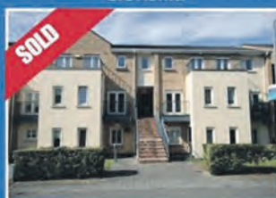
Dursey Row, Blanchardstown