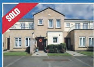
Annagh Court, Blanchardstown