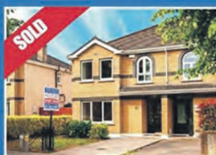
Sorrel Heath, Clonsilla