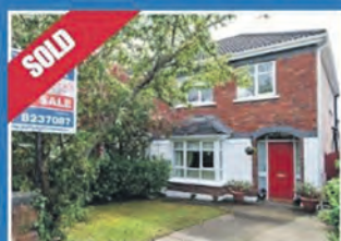
Allendale View, Clonsilla