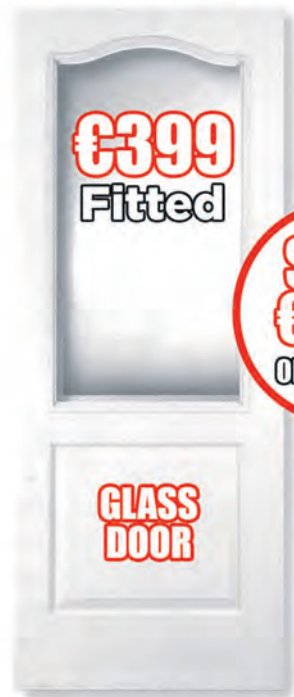
Classique glazed woodgrain clear glass