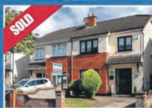
Glenealy Downs, Clonsilla