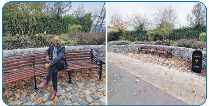
Melville Road Pylon Beautification Garden

Fingal County Council for the brilliant and exquisitely beautiful facilities that have been established in Dunsoghly Estate and Melville Road in Dublin 11.