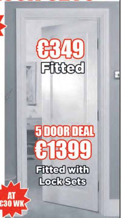
With Lock Sets