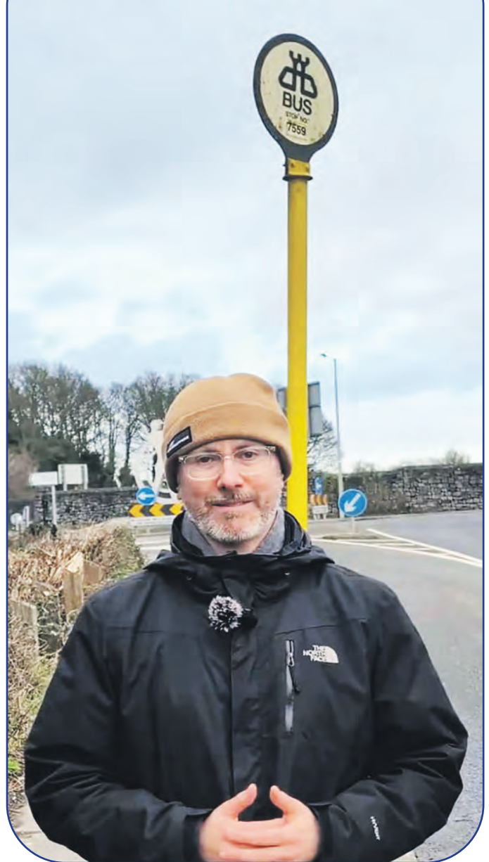
Roderic O’Gorman TD standing at a bus stop in Hollystown, D15 with no bus shelter.

“I have always felt the NTA needs to put a greater focus on the issue of the commuter experience - just one uncomfortable journey can turn somebody off using public transport, and getting drenched on a rainy day waiting for a bus that might be running late is a far too common