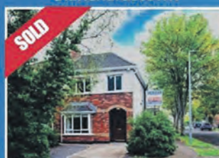
The Drive Hunters Run, Clonee