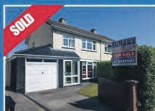
Orchard Court, Clonsilla