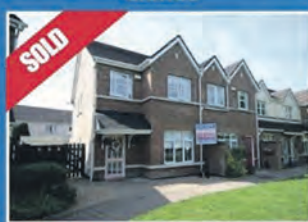
Latchford Square, Clonsilla