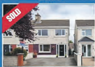
Meadow Drive, Clonsilla