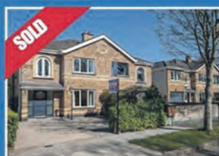
Charnwood Green, Clonsilla

Having recently SOLD the following properties in Dublin 15, we now require similar properties for disappointed under bidders.