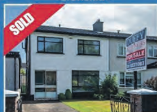
Brookhaven Park, Blanchardstown