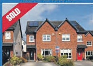
Castlegrange Lawn, Clonee