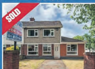
Ashling Heights, Blanchardstown