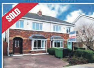
The Rise Hunters Run, Clonee