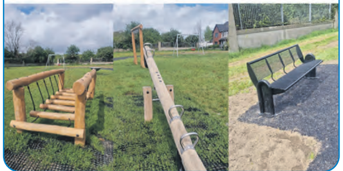
Dunsoghly Estate Playground Upgrade