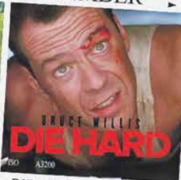
DIE HARD @ 9:30PM