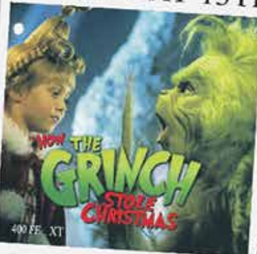
HOW THE GRINCH STOLE CHRISTMAS @ 6:45PM