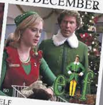
ELF @ 9:30PM