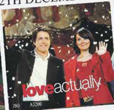
LOVE ACTUALLY @ 9:30PM