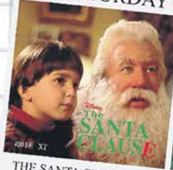
THE SANTA CLAUSE @ 6:45PM